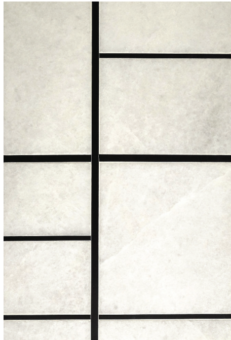
Mondrian concept: Matte Black \frac{1}{4} " and \frac{3}{8} " liners