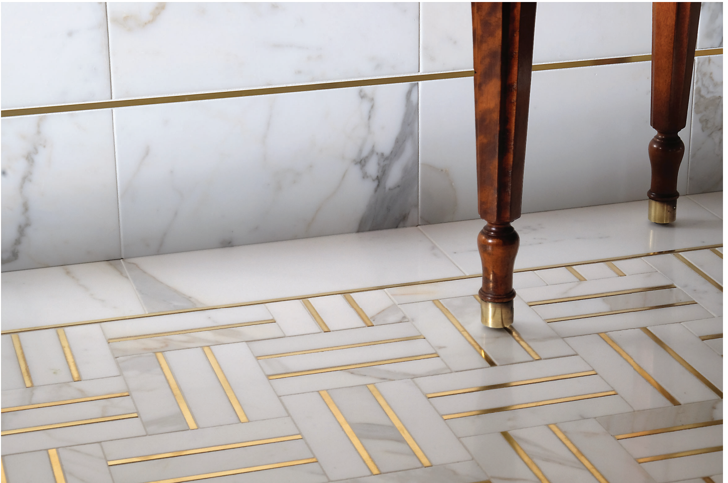
Bronzework Studio Precision Square Liners, 1/4 inch, Living Brass, Hepburn finish, with white marble (70 inch liners cut on job site to fit pattern)