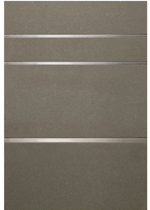
Debussy concept: Stainless Steel with Hepburn finish \frac{1}{4} " and \frac{3}{8} " liners