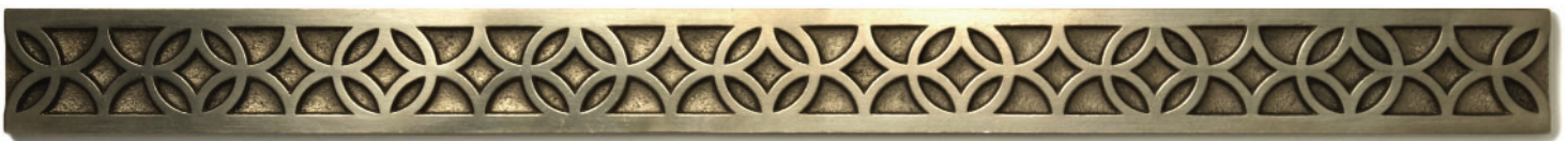
Galileo 1 × 12" border