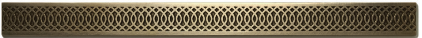
Octave 1 × 12" border