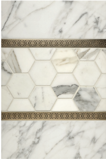
Holly Go Lightly concept Bebop 1 × 12" border Traditional Bronze