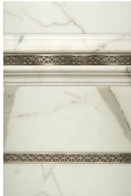
Mrs. Robinson concept Galileo 1 × 12" border White Bronze