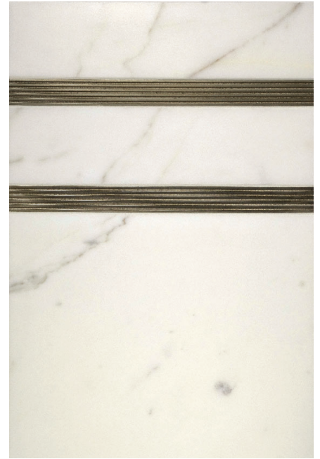
James Bond concept Tuxedo 1 × 12" border White Bronze