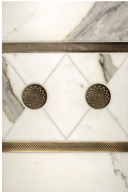
Juliet concept Octave 1 × 12" border, Dahlia 2.5" diameter inset Traditional Bronze