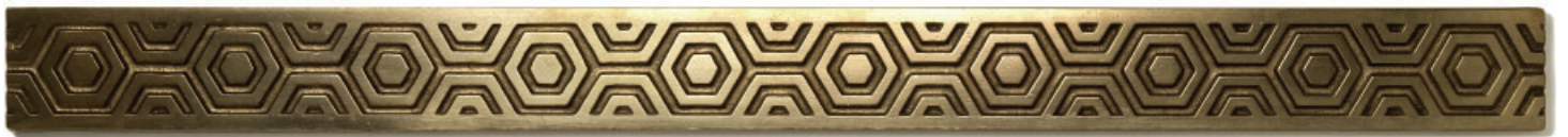
Bebop 1 × 12" border