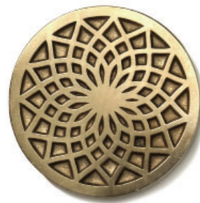
Dahlia 2.5" diameter inset