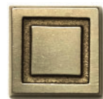
Square 1 × 1" corner/inset