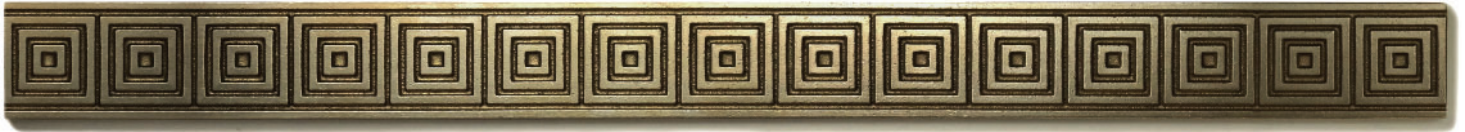
Quadrille 1 × 12" border